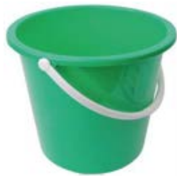
PLASTIC GREEN BUCKET 10LTR