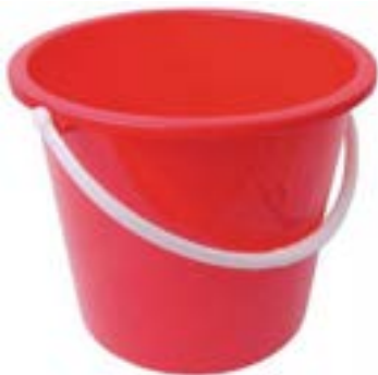
PLASTIC RED BUCKET 10LTR