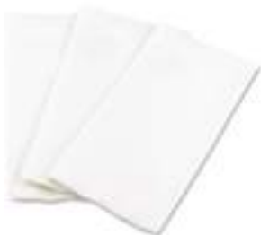
2PLY NAPKINS WHITE 8 FOLD (40CM) (2000)