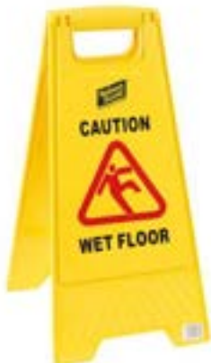
WET FLOOR/CLEANING PROCESS FLOOR SIGN (1)