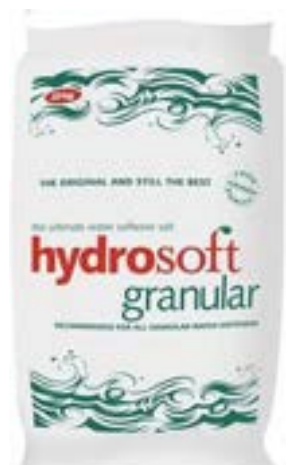
DISHWASH SALT, 25KG