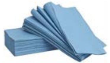
HAND TOWELS BLUE 1PK 2400PK