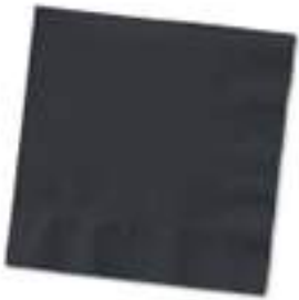
COCKTAIL NAPKIN BLACK, 4000PK