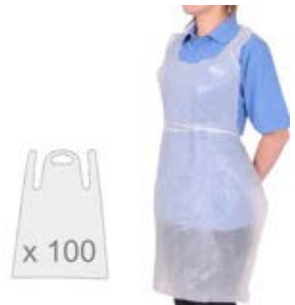
WHITE FLAT PACKED APRON (100)