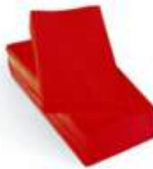
2PLY RED NAPKINS 8 FOLD 2000PK