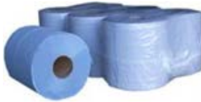
BLUE ROLL 1X6