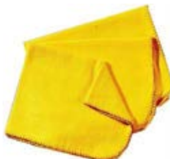
HEAVY YELLOW DUSTING CLOTHS (1X10)