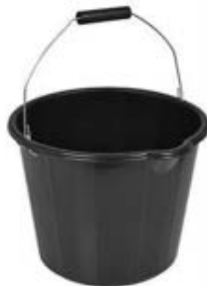
BLUE FLAT PACKED DISPOSABLE APRON (100)