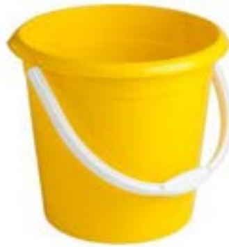
PLASTIC YELLOW BUCKET 10LTR