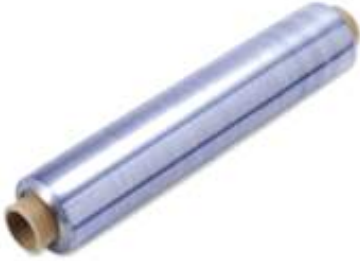
CLING FILM LARGE