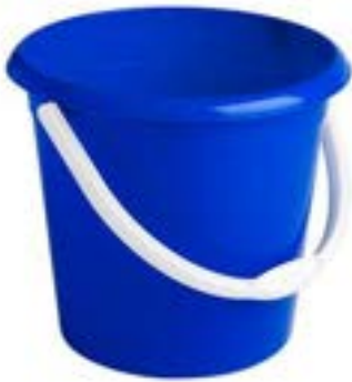
PLASTIC BLUE BUCKET 10LTR