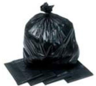
BLACK COMPACTOR BAGS 20KG - 100PK