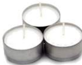
TEALIGHT CANDLES 8 HOURS (BAG X 75)